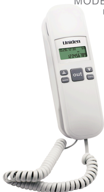
PLEASE READ BEFORE USE